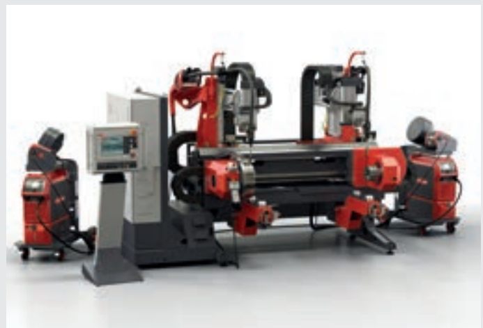
/ FCW Compact Dual (2 weld heads and tailstock)

/ Perfect Welding / Solar Energy / Perfect Charging